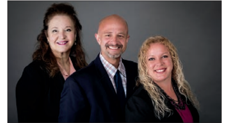
Wealth Advisors Team

Wealth Advisors located at Ideal Credit Union* offers educational workshops aimed at providing you with the know-how to take charge of your financial future. During these no-cost, no-obligation workshops you'll learn about the various factors that contribute to a well-rounded financial plan and get answers to the questions that are most important to you and your specific goals. Below is a list of upcoming workshops for the first quarter of 2020. Registration information can be found at www.idealcu.com/membership-and-benefits/educational-seminars .