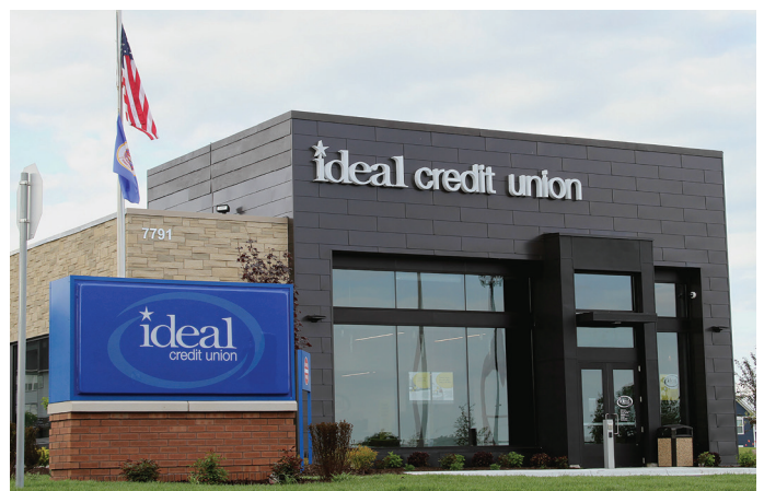
Ideal Credit Union's new Inver Grove Heights branch is now open for business at 7791 Amana Trail, in the Argenta Hills development, next to Target.