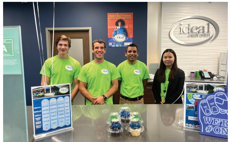
IDEAL CU STILLWATER BRANCH STAFF

June 2024: Ideal CU celebrated its 10-year anniversary and was named #1 Best-in-State Credit Union by Forbes.