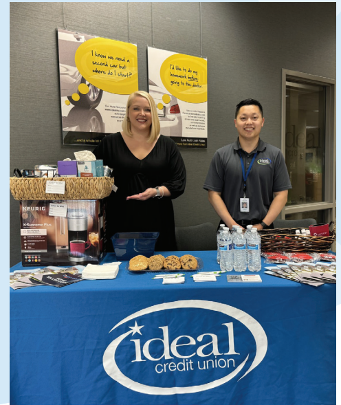
NORTH ST. PAUL REALTOR LOBBY DAY