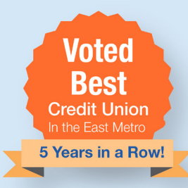
by the Stillwater Gazette

Stillwater when we opened our new branch in December of 2016. Since then, Ideal has grown within the community and added convenience to the nearly 3,000 members living in the area.